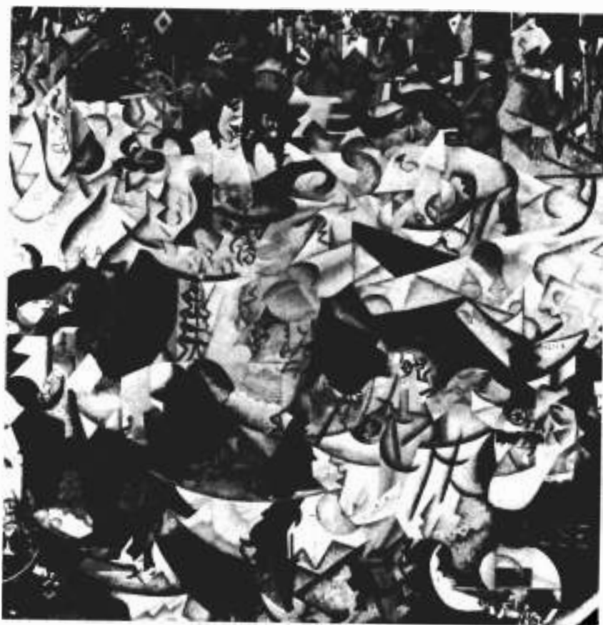
Gino Severini, Dynamic Hieroglyphic of the Bal Tabarin