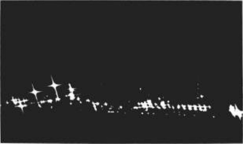
The Lacq gasworks by night

or perhaps even Eisenstein, in Ivan the Terrible . . . I like it a lot' (technician, Paris). Most of the senior executives and members of the professions find the photograph 'beautiful' and 'expressive' and make reference not only to the films of Bergman, Orson Welles, Dreyer, and others, but also to the theatre, invoking Hamlet, Macbeth or Racine's Athalie .